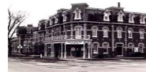
Prince of Wales Hotel

As well, the tour can start and end at various locations. If you would like to start at another attraction in town after your visit, the guide can meet you there and then end the tour at a restaurant for lunch.