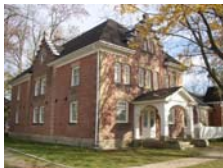
Memorial Hall, Ontario's oldest Museum building and home to the Niagara Historical Society collection

Our trained tour guides will take you on a walk through history to explore the first capital of Upper Canada and the place they call home.