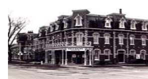
Prince of Wales Hotel

As well, the tour can start and end at various locations. If you would like to start at another attraction in town after your visit, the guide can meet you there and then end the tour at a restaurant for lunch.